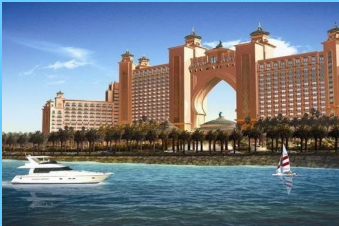
Atlantis, Palm Jumeirah